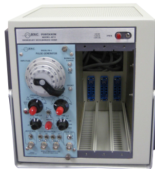
AP-3 with DB-4 NIM Pulse Generator shown above

BNC-blue painted blank panels are available to cover unused module cavities. The part numbers are: Single-width P/N 6823; Double-width P/N 6824; Triple-width P/N 6826. Empty modules in various sizes are available for OEMs or others who wish to design plug-in instruments for Portanims. Contact BNC for source information on modules in bulk or kit form.