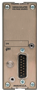
SIM928 rear panel