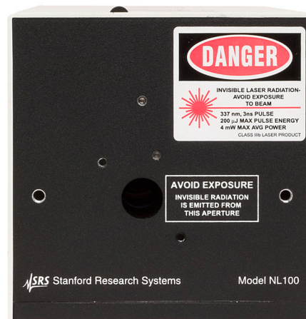
NL100 front panel