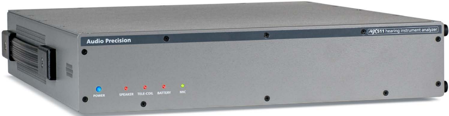
APx511 audio analyzer for hearing instrument production test

AP performance for hearing instrument production test